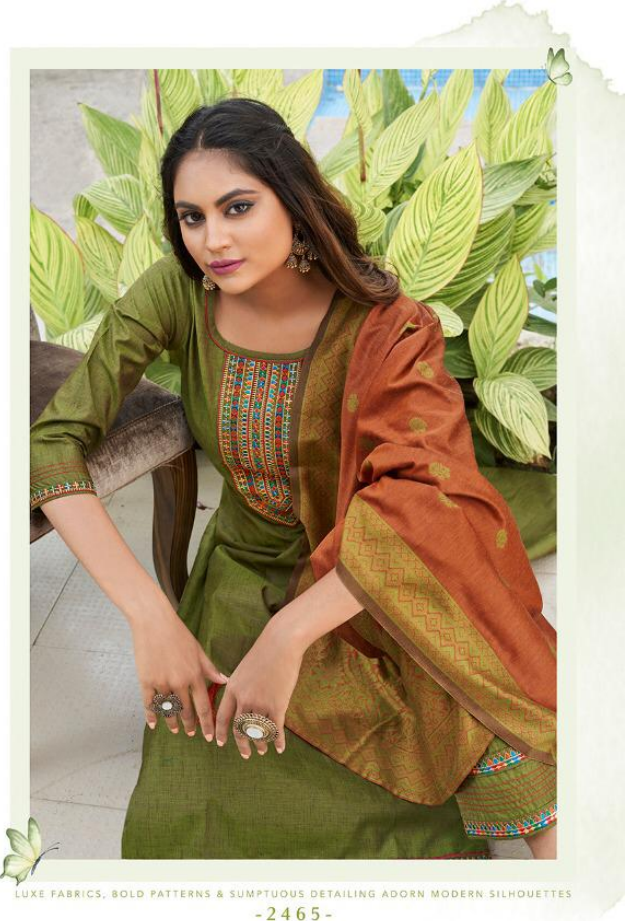
LUXE FABRICS, BOLD PATTERNS & SUMPTUOUS DETAILING ADORN MODERN SILHOUETTES - 2465 -