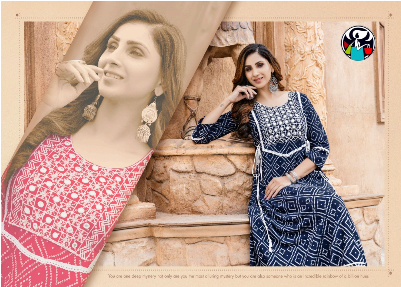
You are one deep mystery not only are you the most alluring mystery but you are also someone who is an incredible rainbow of a billion hues