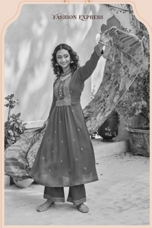
PURE CLEANCES WITH ALLURING FORMAL PATTERNS ON LACY FABRIC AND ADD GLAMOUR TO YOUR STYLE.