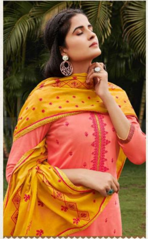
The collection was a perfect blend of Indian silhouettes & contemporary style.